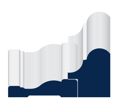
CASING | A COLONIAL 2-1/4" BACK BAND | LBB158