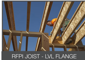
RFPI JOIST - LVL FLANGE