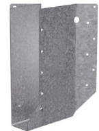
SUR/SUL Skewed 45° Hangers

A hybrid hanger that incorporate the advantages of the face-mount and top-mount hanger. Installation is fast with the Strong-Grip™ seat, easy-to-reach face nails and self-jigging locator tabs.