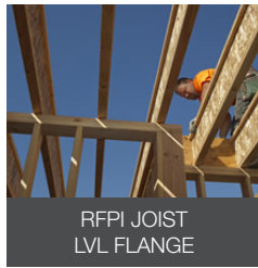
RFPI JOIST LVL FLANGE