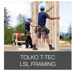
TOLKO T-TEC LSL FRAMING