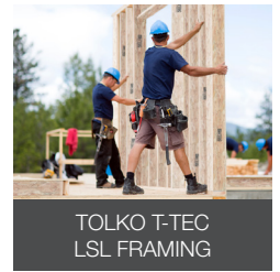
TOLKO T-TEC LSL FRAMING