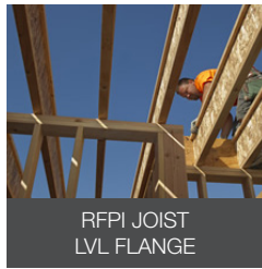
RFPI JOIST LVL FLANGE