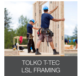
TOLKO T-TEC LSL FRAMING